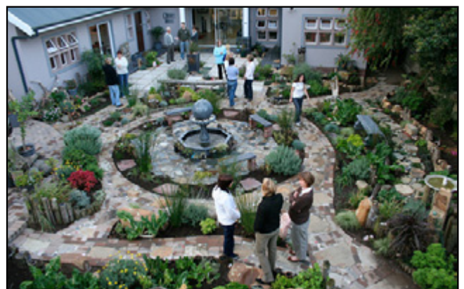
The ‘art garden’ at the Marlene Neumann Centre – Photography and Light.