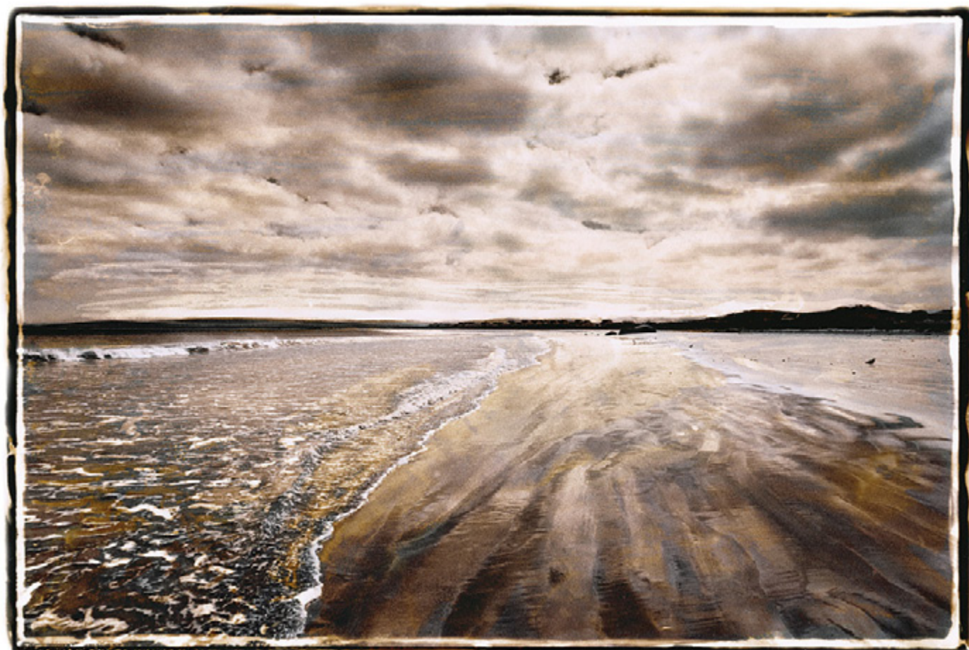
Ebb Tide.