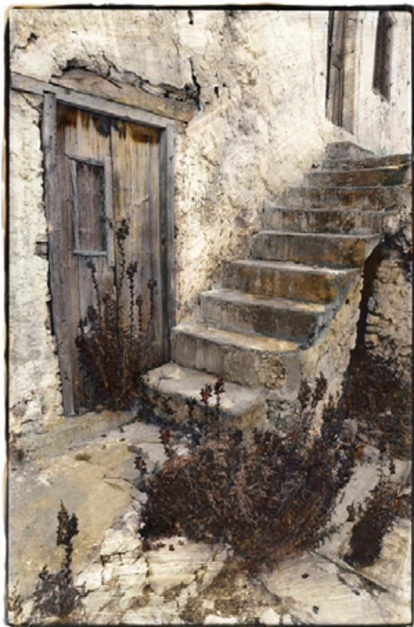
Downstairs Door.