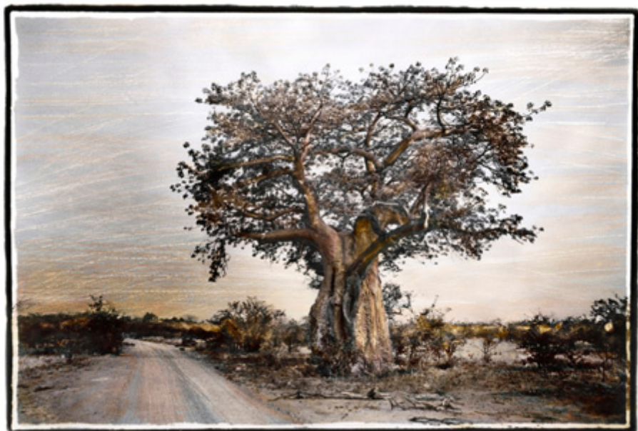
Roadside Baobab. © Marlene Neumann