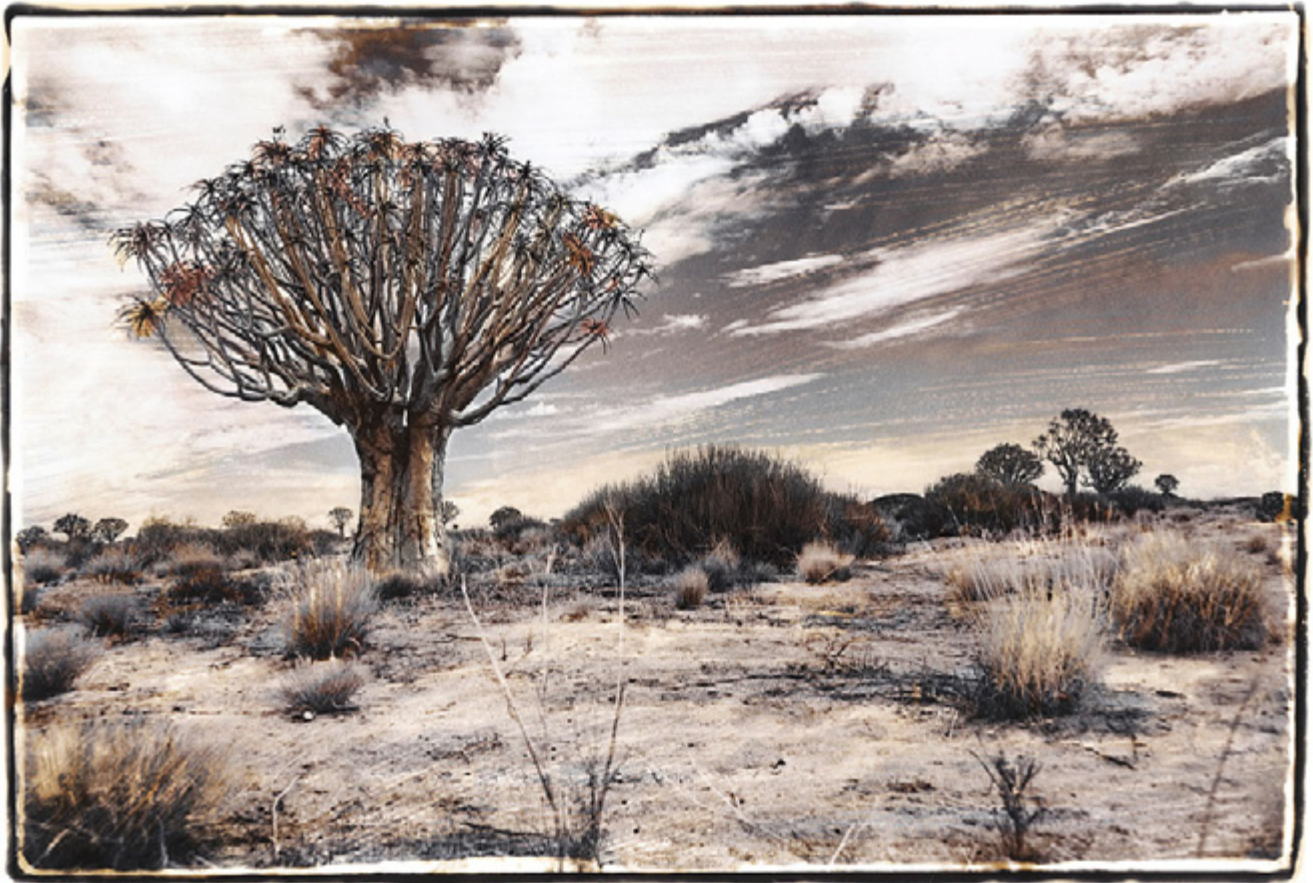
Tribal Tree.