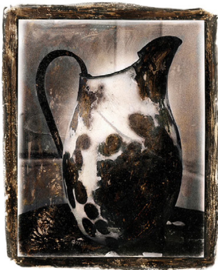
Jug.