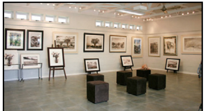
The gallery at the Marlene Neumann Centre – Photography and Light.