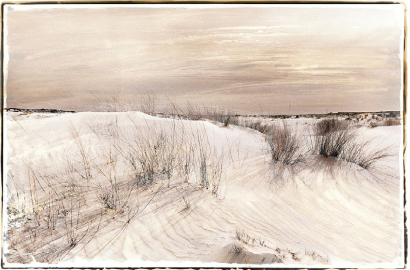
Witsand.