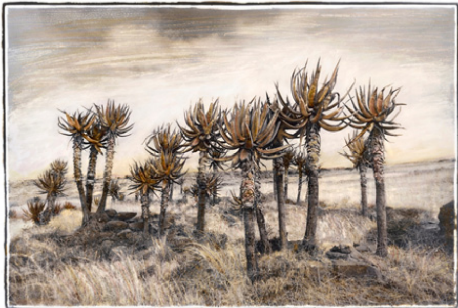
Aloe Tribe.