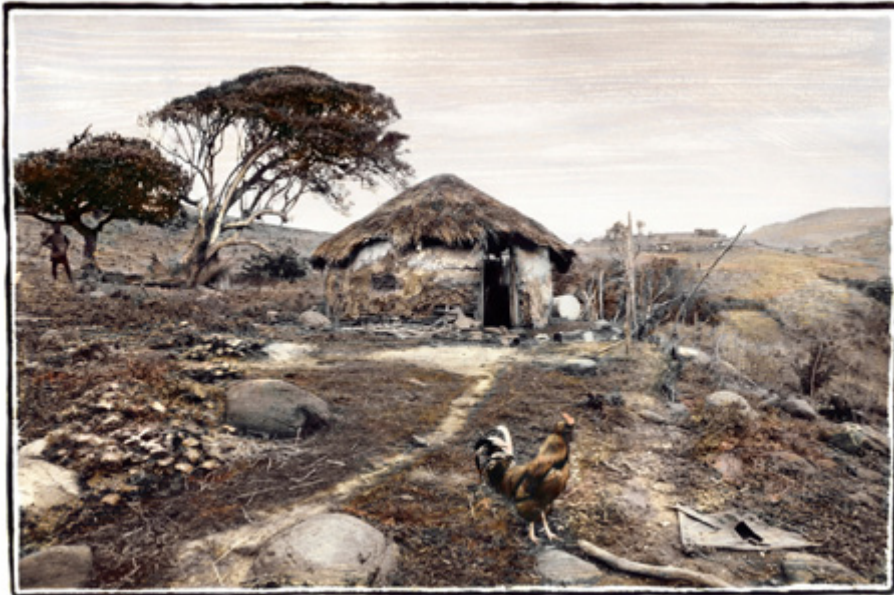
Early Morning. © Marlene Neumann